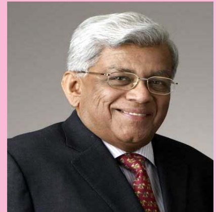
MR DEEPAK S. PAREKH, CHAIRMAN